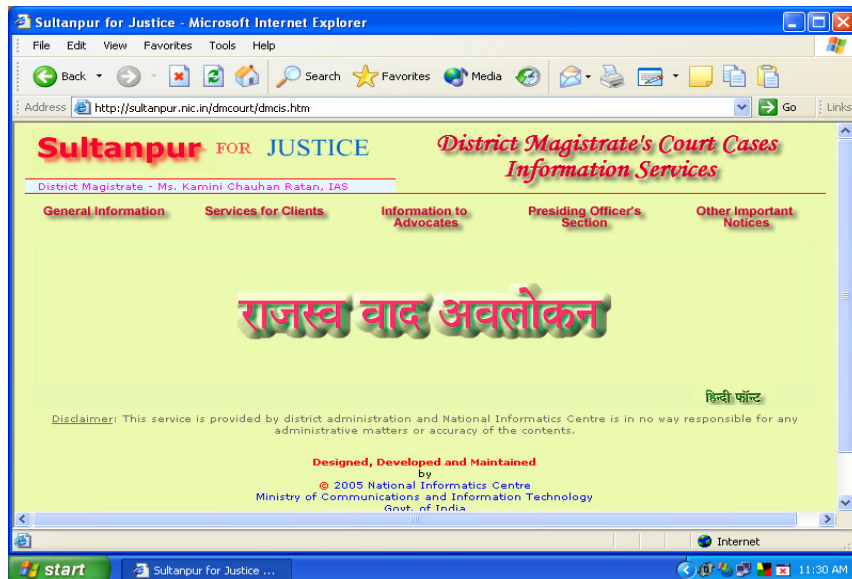
Figure –1: The Main Index Page of RVA

In the words of Ms. Kamini Chauhan Ratan, District Magistrate, Sultanpur: "in addition to providing easy access to the latest status of the court cases, the project will also provide a mechanism to the presiding officers to monitor the cases pending in their courts. This will reduce the time delay in deciding the case and bring efficiency too. Moreover, the transparency brought by the system will also help curb the malpractices of the unscrupulous intermediaries etc."